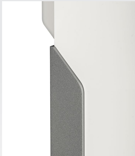
High quality steel frame finish